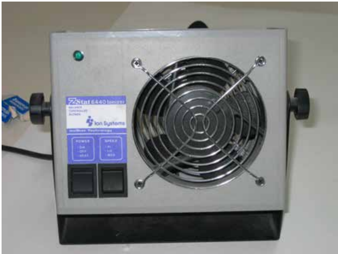
Fig. 4. Air ionizer used to reduce static when opening plastic based-housings.