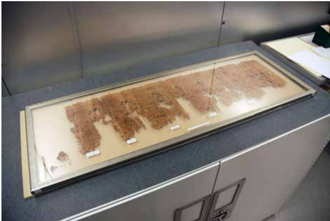
Fig. 2. Papyrus fragment glazed with annealed soda-lime glass.