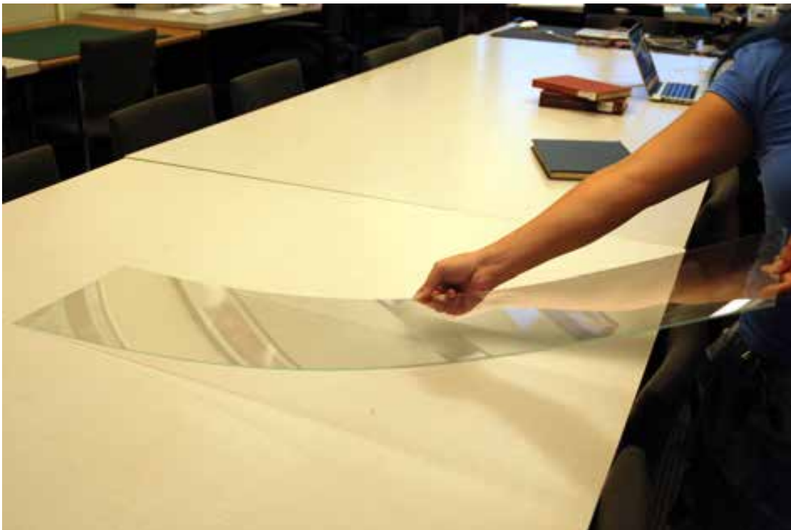
Fig. 6. Flexing two pieces of 1 mm thick Gorilla Glass sandwiched together.