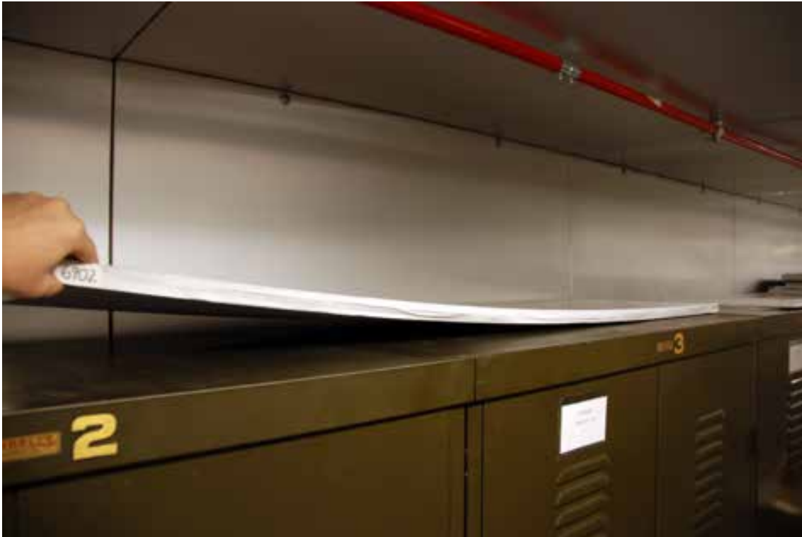
Fig. 5. Flexing of acrylic glazing.