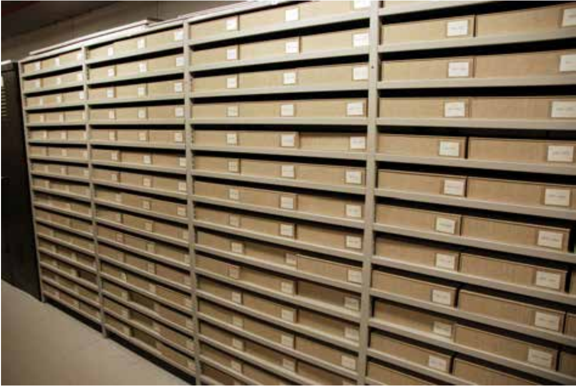
Fig. 1. Clamshell boxes housing papyri on shelves in the vault at the University of Michigan.