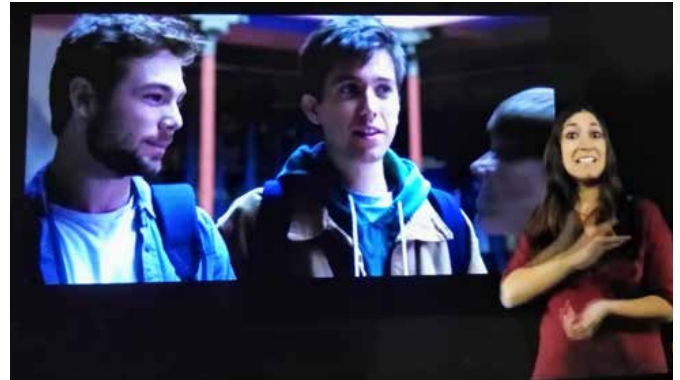
Figure 2. Spanish sign language interpreting on the Movistar+ platform.

More recent studies have established the main functions of third languages in the products we consume: they are used to portray characters, to underline stereotypes, to reinforce arguments, to make some scenes more dramatic (for example if a character does not understand what’s being said in an emergency) and with comical purposes, among others (Corrius et al. 2020). If we take the series Dexter (Showtime, 2006), set in Miami, as an example, where some characters resort to alternating between Spanish and English,