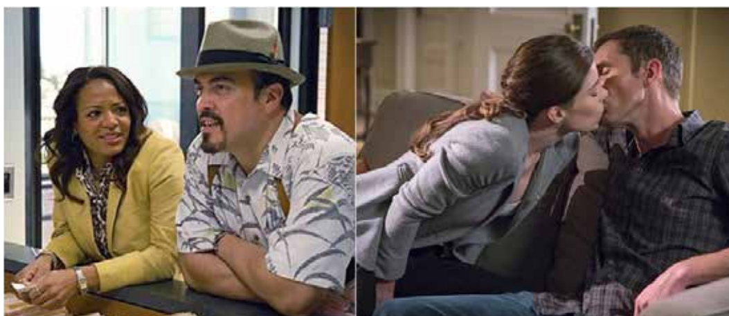
Figure 3. Clichéd characters in the series Dexter (Showtime, 2016). On the left, two Spanish-speaking characters; on the right, two characters who speak North-American English.