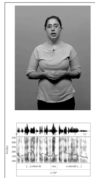
Figure 2: Video still showing speaker emphasizing the word "neu" without accompanying beat gesture, with wave form and F0 contours, i.e., Condition 2 (prominence in speech alone).

During the preparation of the stimuli special attention was paid to the speaker's control over prosodic prominence. A Catalan native speaker was trained to produce the discourse and target items with the same prosody in both experimental conditions. Table 1 shows that the acoustic measures of