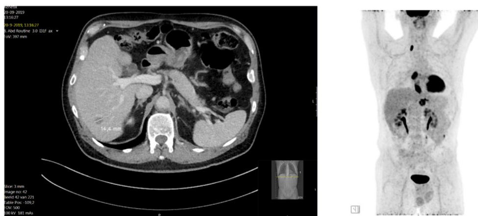
Fig. 2. Follow-up information of real-life clinical case #3 included in this survey.

oncologist, and radiation oncologist, the following specialities were present at the MDT meetings: a radiologist in 60%, a gastroenterologist in 49%, a pathologist in 40%, and a nuclear medicine physician in 28%. Table 2 shows the characteristics of the participating MDTs.