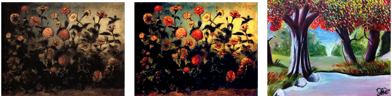
Figure 2: Original image (left), target image (right), and the result of the color modification performed by [17](center).