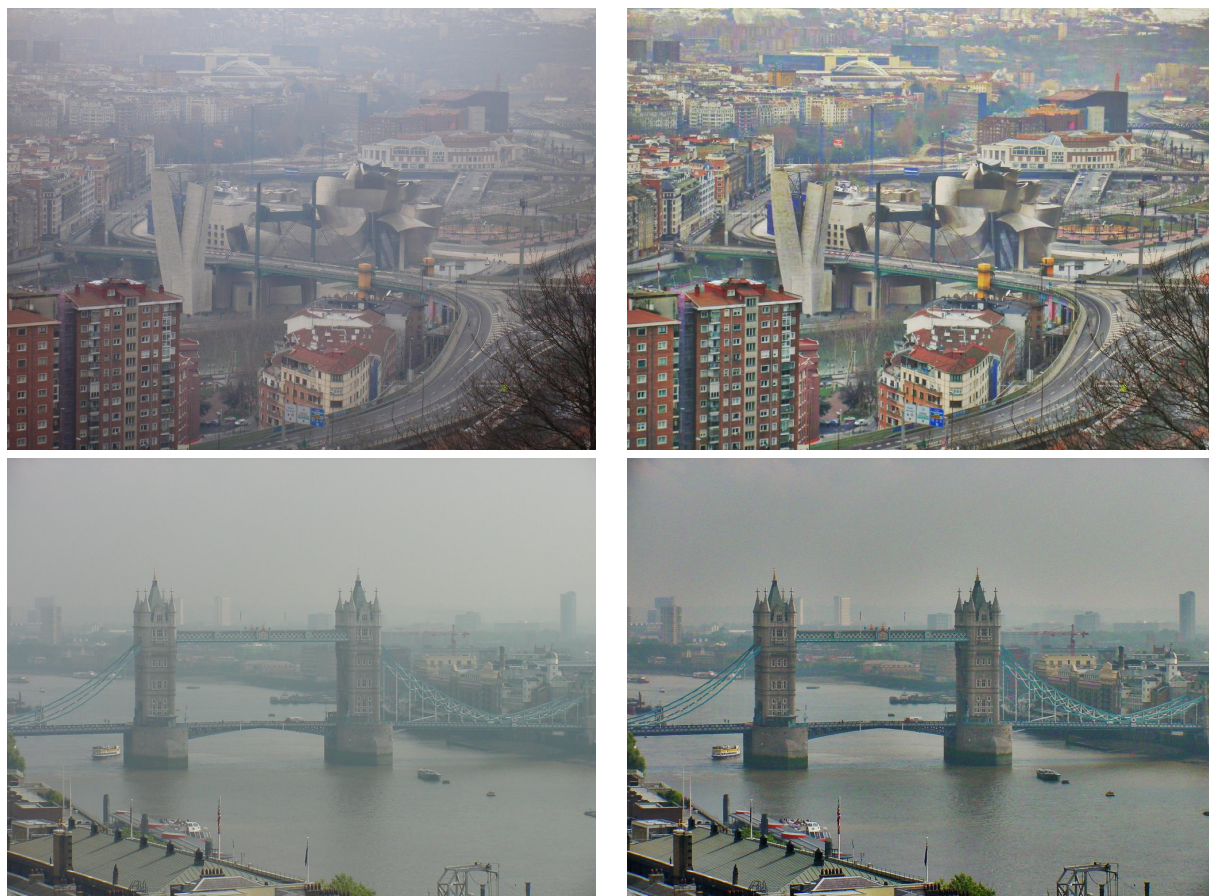
Figure 3: Original images (left) and images dehazed using Galdran -et al.- method [4].