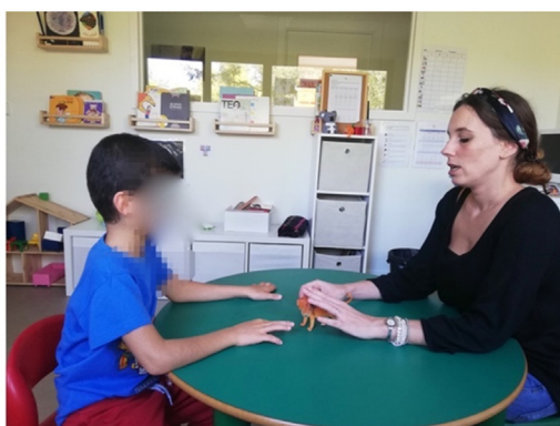
Participant re-acting the event.