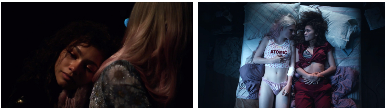
Figure 6. Rue hugs Jules; Jules and Rue in Jules’s bed.

This complicity between Jules and Rue increases throughout the series and they build a relationship of emotional intimacy that goes beyond friendship. An intimacy that includes feelings of closeness, bonding, support, understanding, acceptance, and self-exploration of one towards the other (Sternberg, 2000). This is how Jules becomes the subject of value in Rue’s storytelling.