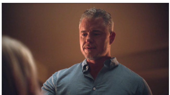
Figure 3. Cal touches Jules; Cal talks to Jules.