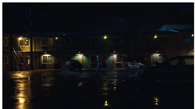
Figure 2. Jules on the way to the motel; Jules in the motel's parking lot.